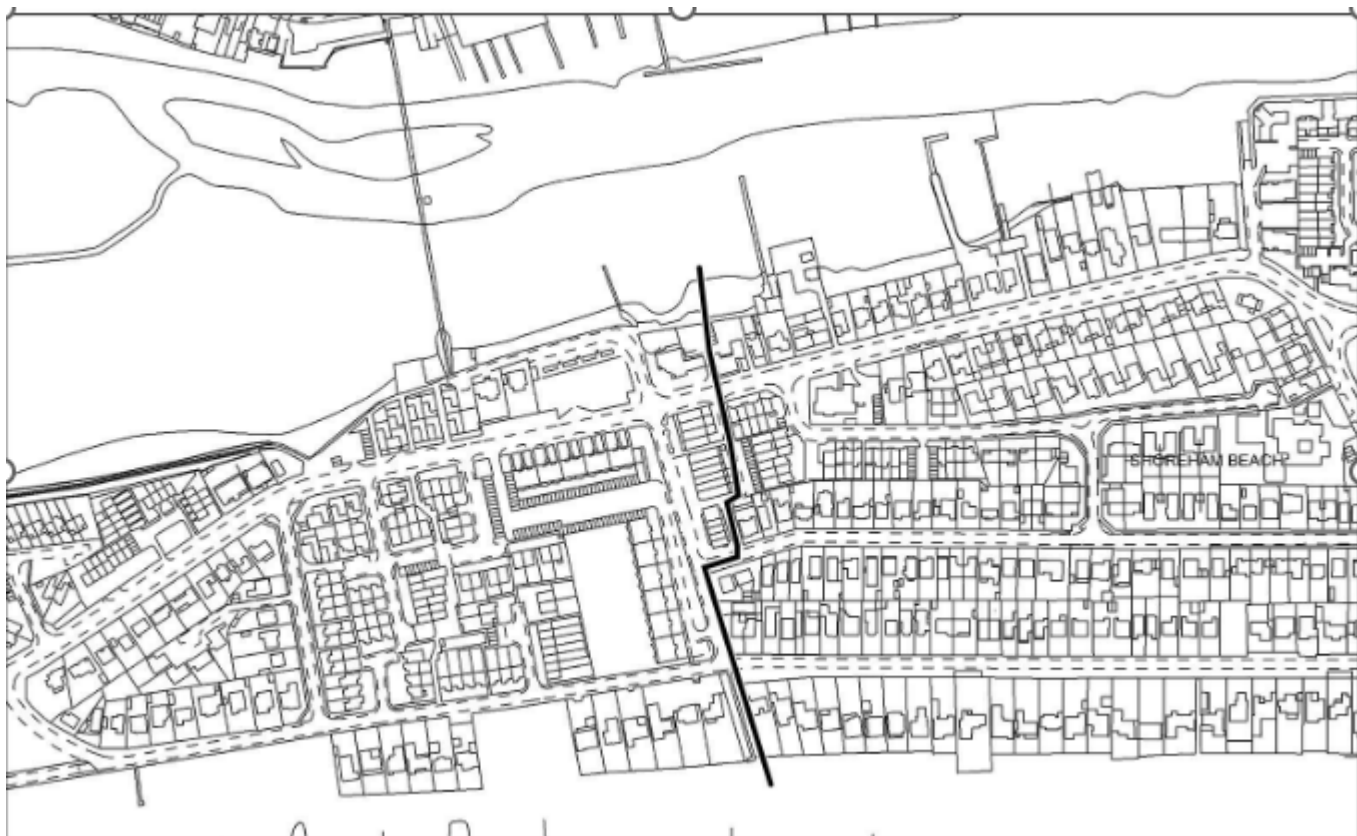
Shoreham Beach Primary School catchment split map

The oversubscription criteria differs from other Community schools in the county. Priority is given to children who live in the catchment area to the east of Ferry Road above those who live in the catchment to the west of Ferry Road. The oversubscription criteria can be found in Appendix 1. The map below is for illustration purposes only. Parents can check at school catchment areas as to which school's catchment they live in.