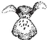
Early Purple Orchid