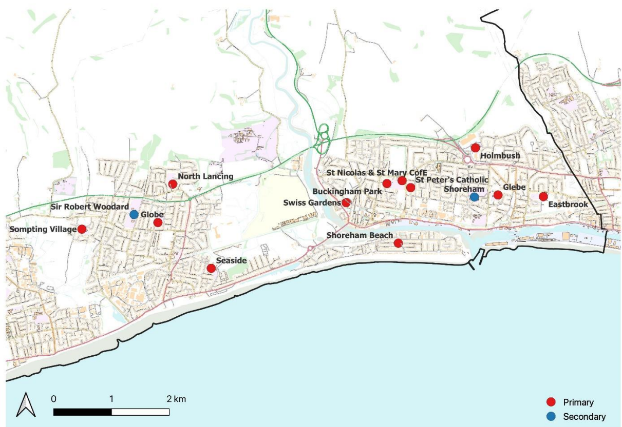
Figure 1: Map of schools in Shoreham and Lancing