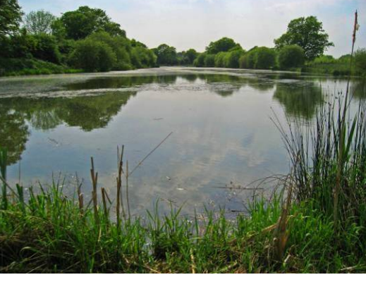
Hammer pond, Knepp Estate - Site of Nature Conservation Importance (SNCI)