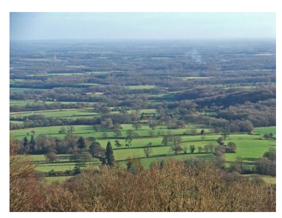
The well wooded field pattern of the Low Weald