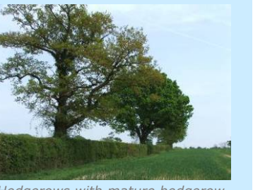
Hedgerows with mature hedgerow trees

dissected by rivers which are often accompanied by low-lying meadows with alder and willow wet woodland.