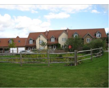
Warnham development - sympathetic use Contemporary timber bus shelter of materials, palette and design details

Enclosure: hedges - typically hawthorn, yew, privet, beech, hornbeam, box, mixed native hedge; timber picket fences and gates, chestnut paling, Wealden sandstone walls some with brick coping