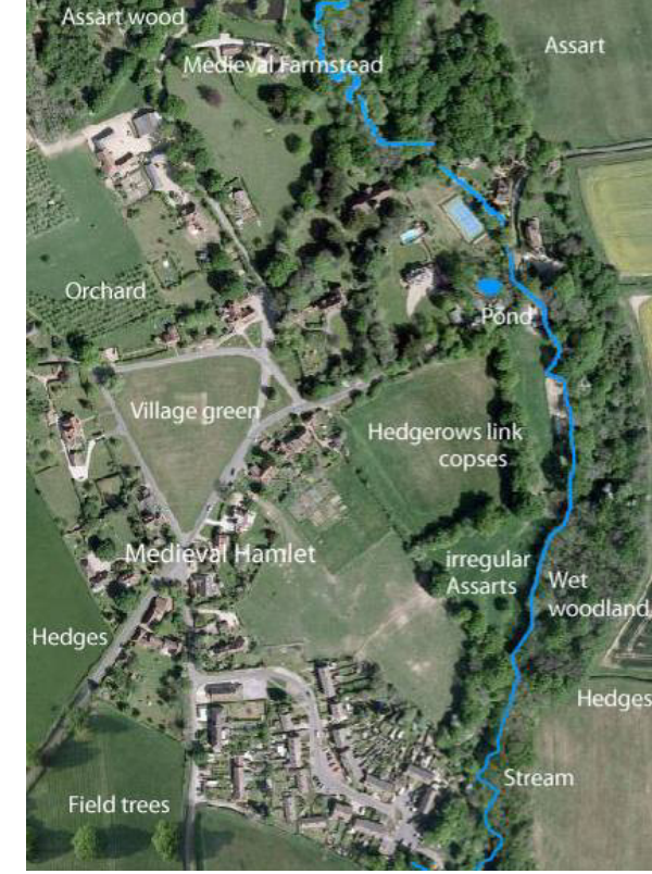
Medieval hamlet of Lurgashall in relation to key landscape features

It is important to consider local distinctiveness within plans, policies and developments incorporating distinctive qualities and reflecting the county's sense of place.