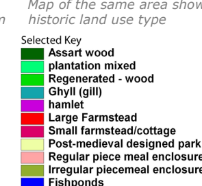
Map of the same area showing the existing

Early 20th century (AD 1914- AD 1945) Late 20th century (AD 1845- Present)