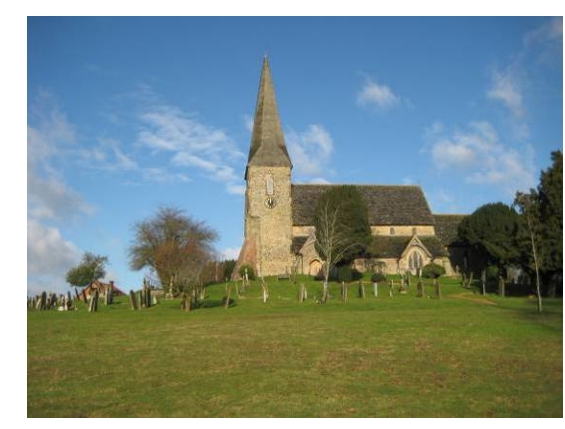
Church at Wisborough Green