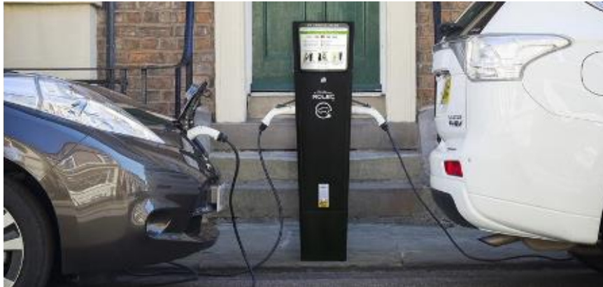
An example of on street charge point

maintain all our street lights under a 25yr PFI (Private Finance Initiative), this passes all the risk of the street lighting to Tay Valley Lighting. There are some complex and costly legal issues about providing another party access to the lights. Although these might potentially be overcome it will take significant time and resources to do so, and there is no guarantee they can be resolved. We have ambitious aims for EV in the County, and need to be taking early action.