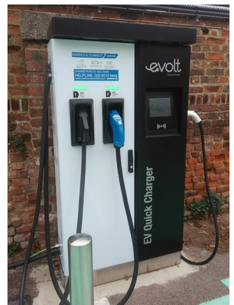
An example of a Rapid Charge Point