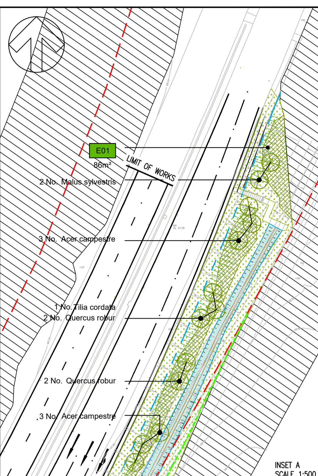
INSET A SCALE 1:500